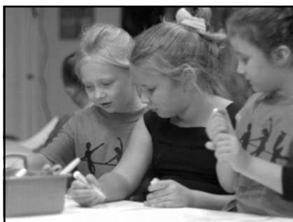
Dancers enjoy crafts and make a scrapbook!